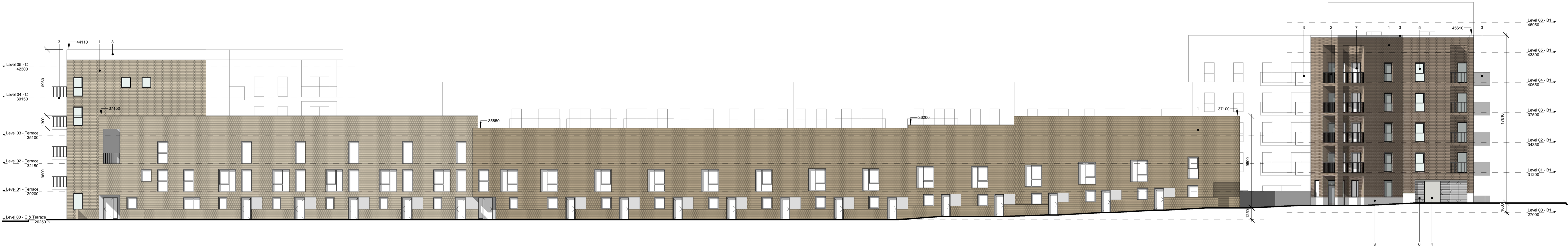
4 House Terrace - North Elevation 1:200