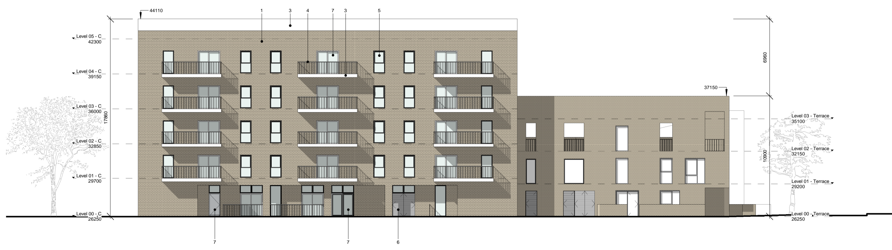
3 Block C - East Elevation 1:200