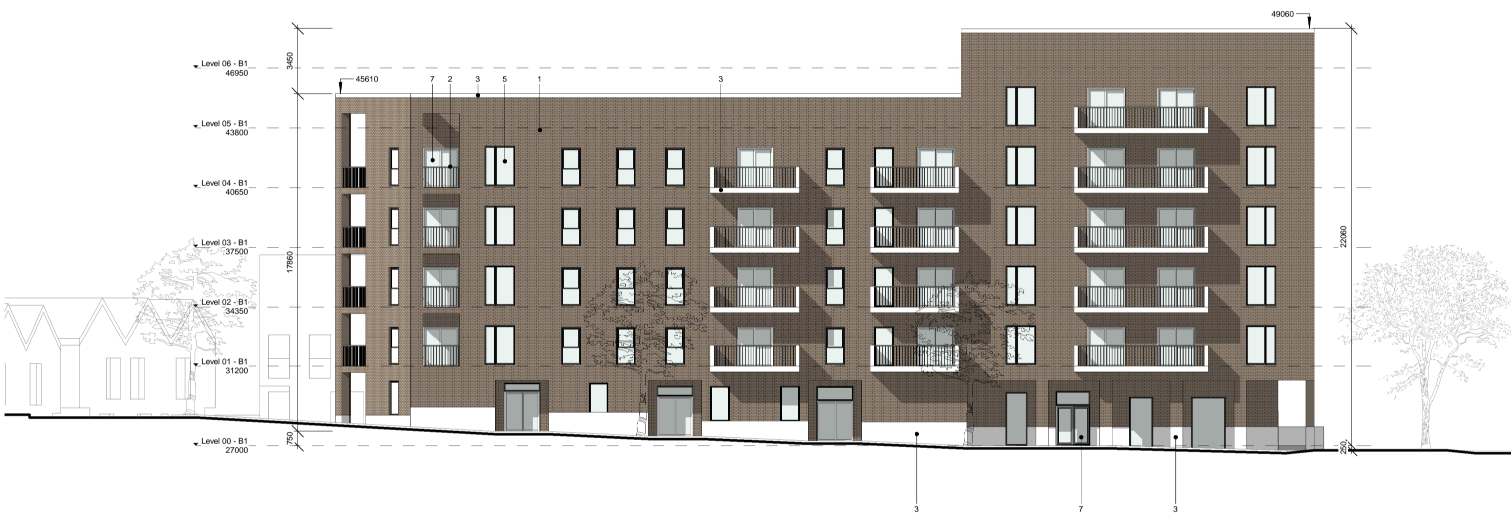
2 Block B - West Elevation 1:200