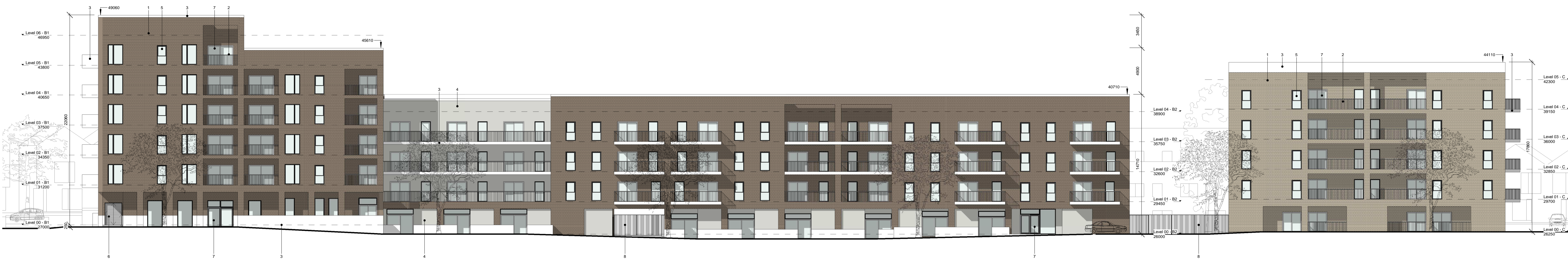
1 Block B & C - South Elevation 1:200